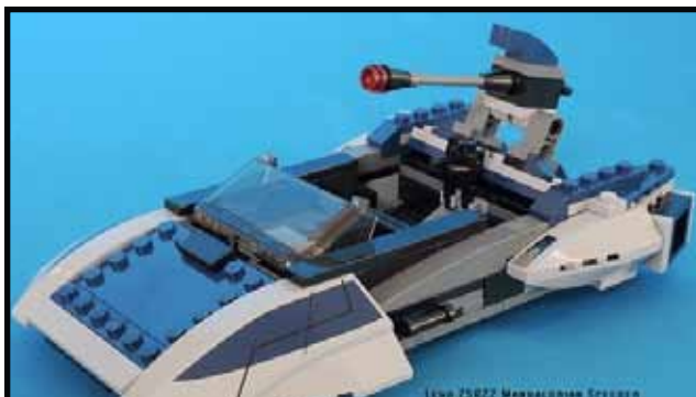
The Lego model of the Mandalorian Speeder.

With our presence at C6 and, more recently, at Celebration Europe, the Mercs have really shown that we can put on exciting displays and Celebration 7 promises to be bigger and better than ever!