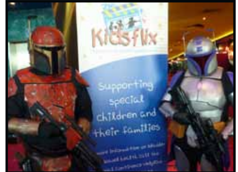
The Sandhawks invaded Kidsflix in Werribee (Melbourne, Australia).

Whilst money is important; the joy that we can bring to the event far outweighs numbers on paper. However, these values help the public understand the value of what we do and how our presence at these events is more than just standing in armor. The next time you're deciding whether or not to try a charity troop remember that the value goes beyond our presence to have a much bigger impact on both the club and community as a whole.