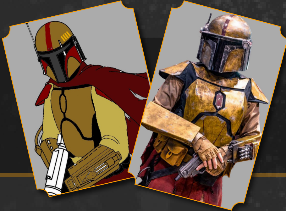
Figure out what you like, what you don't, and try to decide on a general design concept. Another great way to start to visualize your ideas is to use an online tool like MandoMaker or MandoCreator to quickly test color combinations and various design options on a premade template in your web browser. Compare color choices, and various basic armor and accessory configurations until you have an idea of where you want to take your build.

Websites like Pinterest are a great resource for collecting ideas and concepts, and a good old fashioned Google Image Search is always good for finding pictures of other Mandos to use as inspiration for your own build.