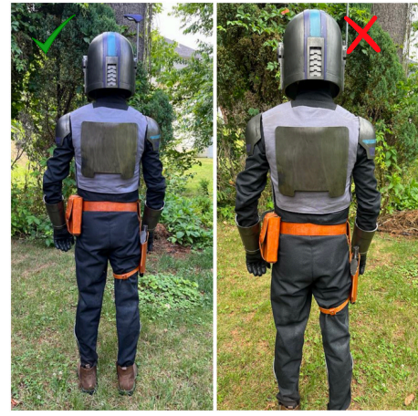
Ensure app team can see the full subject