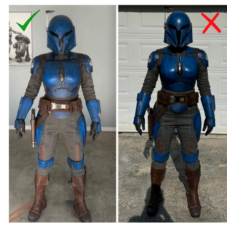
Well lit subjects show much more weathering and detail than poorly lit subjects