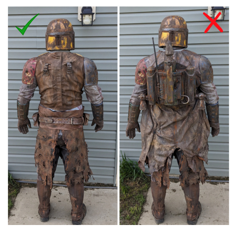
If a cape/ poncho/ duster hides armor, it must be removed for application photos