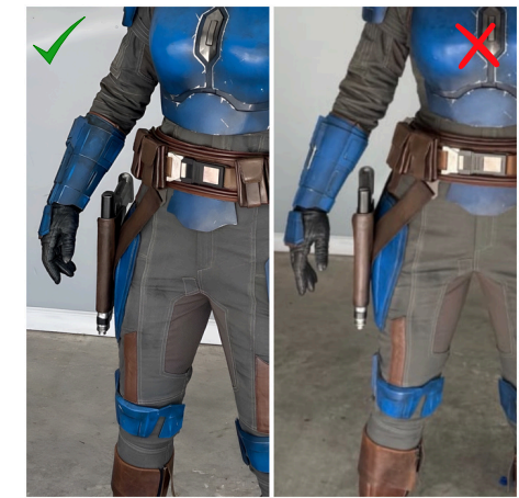
Kit must not have too much loss of detail