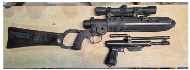
Note - photos must be of ALL weapons