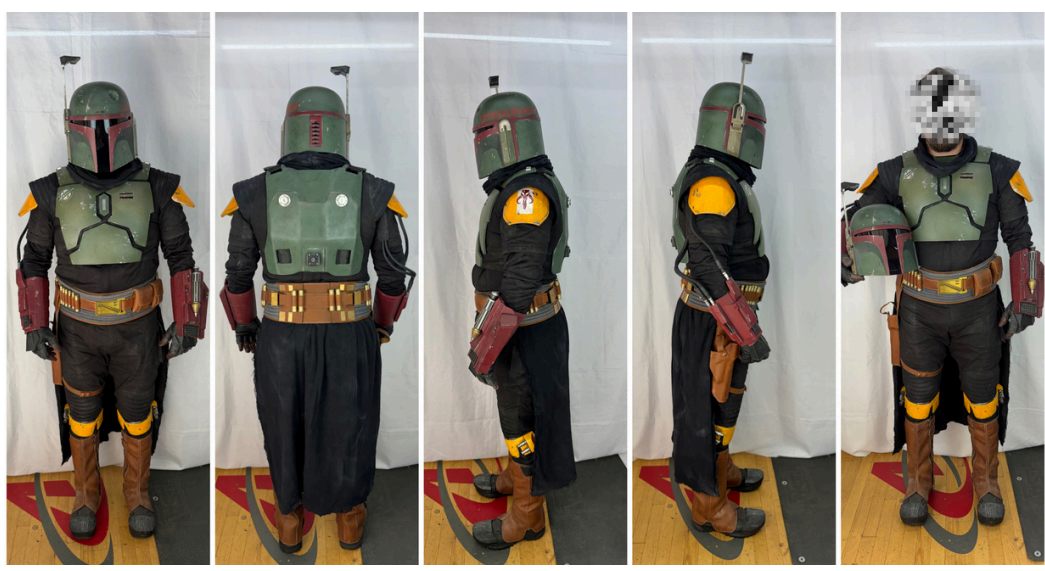
Front Right Left Back Bucket and balaclava off