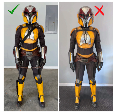
Chest diamond level ensures you don't distort sizing